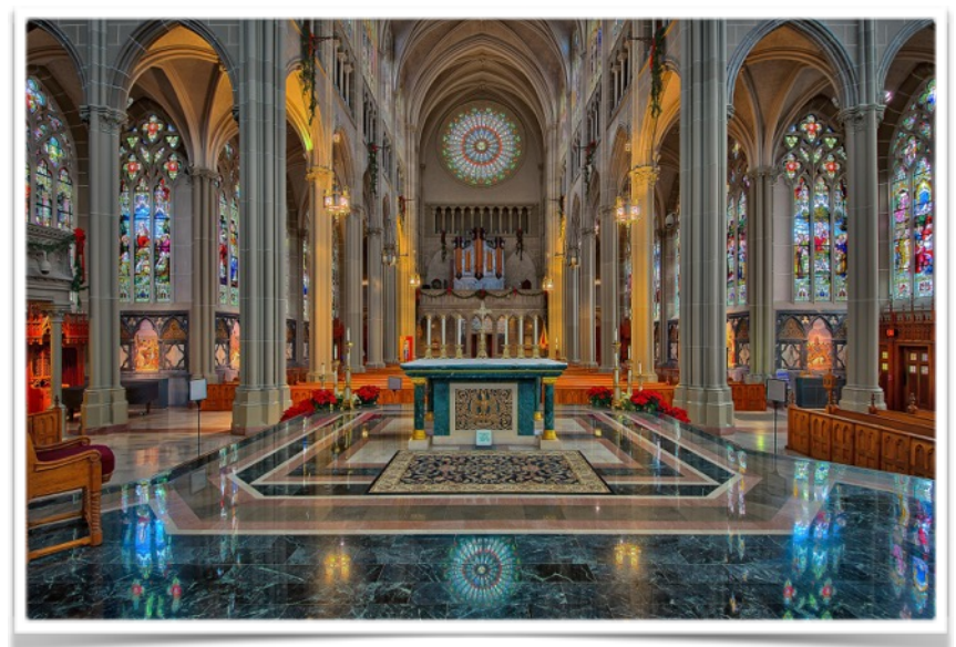
Best of Show: Jeff Lackey